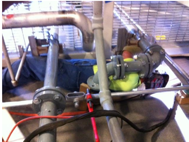
Jay Kelly welding brackets in tight spaces!

We are looking for new updated job site photos. Get your phone or camera out and take some great pictures of jobs in progress or completed. Take some job site photos with our men working SAFELY. Send in as many photos as you can! There will be a winner chosen each month. Your photo could be the next great picture posted on our website!!! Please email all photos to Meagan Cunningham at mmcunningham@westsidehammer.com